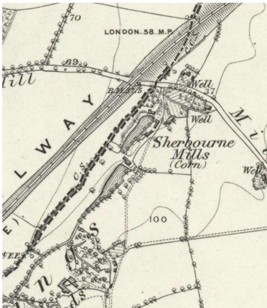
6 inch O.S Map surveyed 1875 Show the upper and lower mills