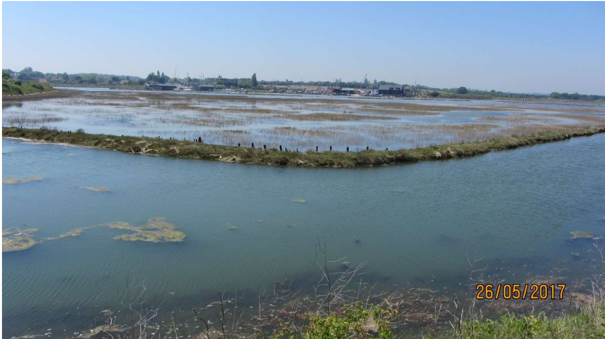
Willow stakes forming the banks of the tidal lagoon.