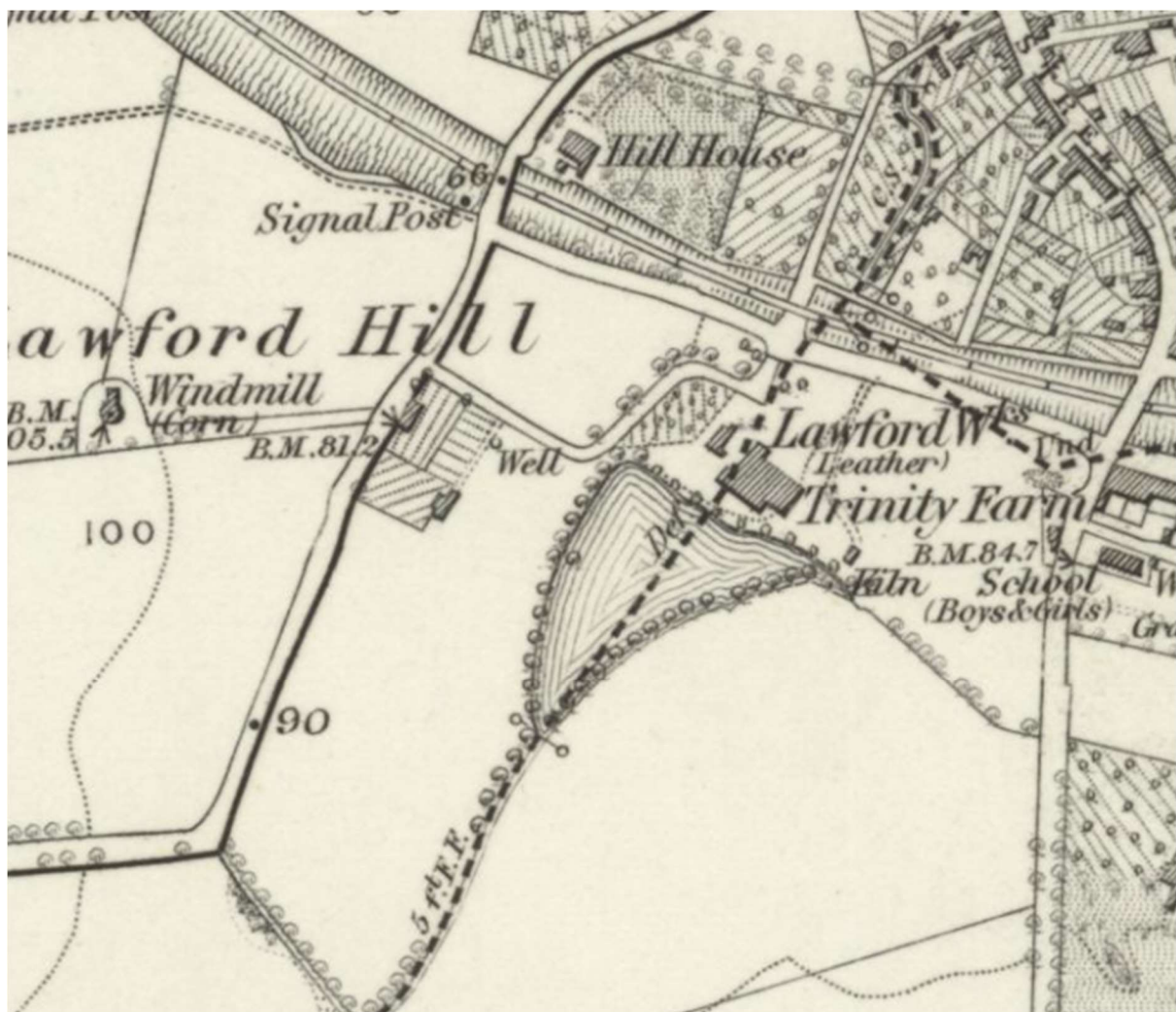
6 inch O.S map surveyed 1875

C1870 photo Lawford Oil mill built on site of Tendring Hundred water works. [D/F31/5]