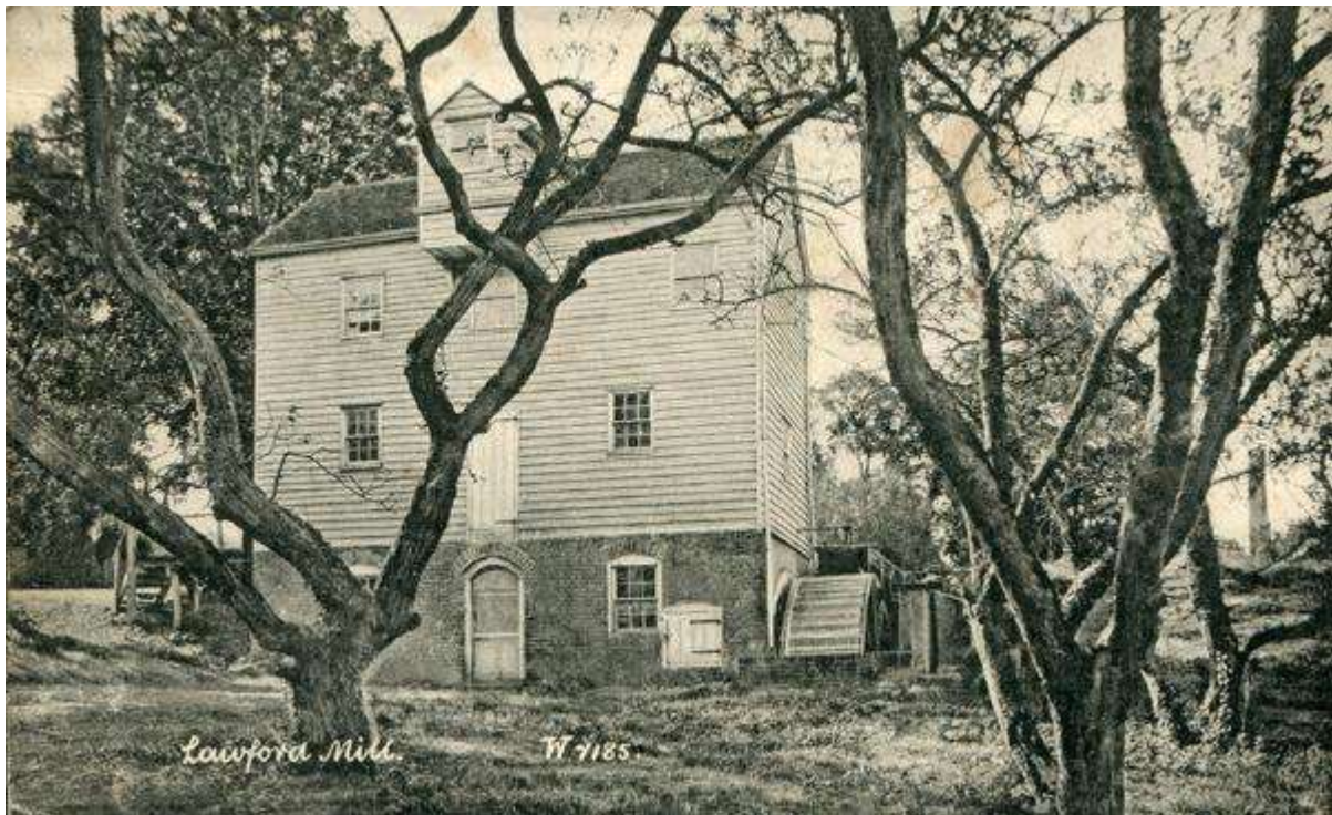
Post card of the lower mill

J. Booker. Batsford Guide to Industrial Archaeology 1980.~Former water mill, now empty. C18/C19. Timber framed and weatherboarded, red brick ground floor. Red plain tile roof. 3 storeys and loft with lucam to north face, outshot lean-to to south. North face. Central lucam on curved brackets, window to north. 3 window range of small paned vertically sliding sashes, moulded surrounds, those to ground floor with segmental heads, central door to first floor, central panelled door to ground floor within segmental head, small vertically boarded door to right. The south lean-to faces the mill pond and the exterior overshot wheel, removed 1930's, was to the east face. Of 5 bays with hanging knees to tie beams. 2 pairs of stones remain in the mill, one by H & C Collins, Milton and the other by Tinsby, Ipswich and 2 stone nuts. The dam wall curves to enclose the mill pond to the south and is of concrete faced brick. The mill stream passed under a bridge to the west of the Mill (not now visible) to drive the waterwheel. Once a partner to a long demolished upper mill.