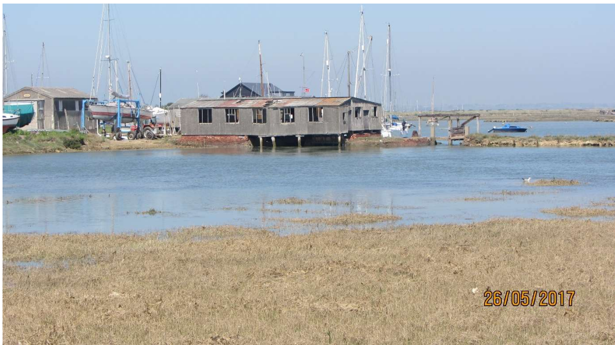
Structure on the site of the old the old tide mill